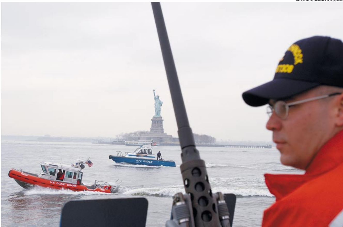
SURE PATROL. Officers of the U.S. Coast Guard and New York Police Department monitor traffic near the Statue of Liberty.