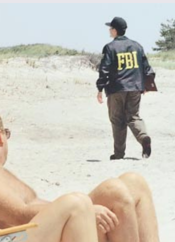
for witnesses of TWA 800 crash.

May 10, 1999: A Senate subcommittee raises serious questions about the FBI's probe of the July 17, 1996, crash of TWA Flight 800 off the coast of Long Island, N.Y., in which 230 people died. Sen. Charles Grassley, an Iowa Republican, accuses the FBI of jeopardizing flight safety by trying to bottle up a Treasury Department report that blamed the crash on a mechanical failure and not a terrorist attack.