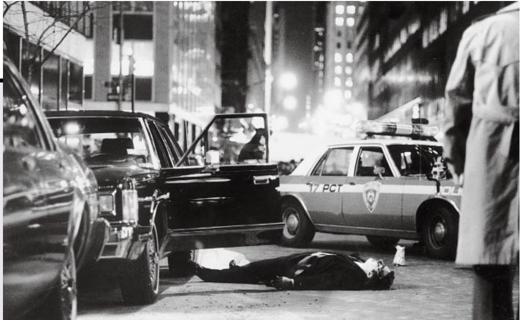
A bodyguard for Mob boss Paul Castellano, who is in the car

arrested more than 70 people tied to New Jersey's DeCavalcante family, decimating its leadership. And in March came indictments of 48 alleged mobsters tied to New York's infamous five families.