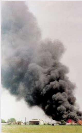
Branch Davidian compound