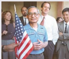
Wen Ho Lee's homecoming