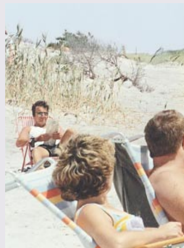
An FBI agent scours the beach